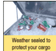
Weather sealed to protect your cargo