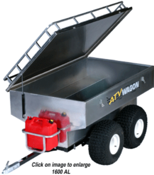
Click on image to enlarge 1600 AL

Hunting, Fishing, Exploring, Camping Bring It Anywhere