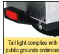
Tail light complies with public grounds ordinances