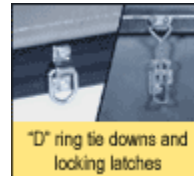
"D" ring tie downs and locking latches