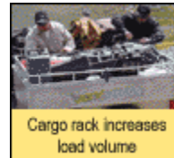
Cargo rack increases load volume